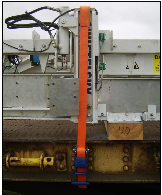
Securing at vertical frame work